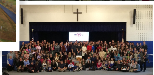
RGBC FIRST SUNDAY

Putting Down Roots is a three-year initiative to better position us as a church to more effectively live out our mission to exalt, equip, and engage.